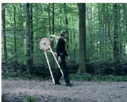
The walking Pigeon