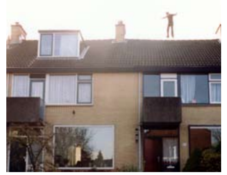
I'm sorry, but not surprised about the skylight