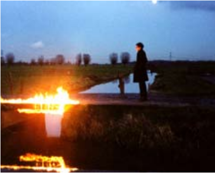
Het werd later en nog een keer I Smile at the world...