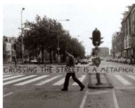
But we'll know, won't we?