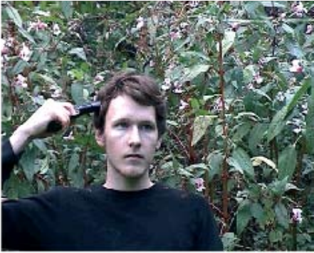
Suicide nr. 8945 til 8949