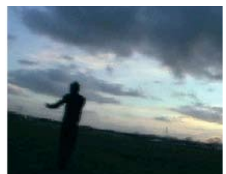
The dance movie 2